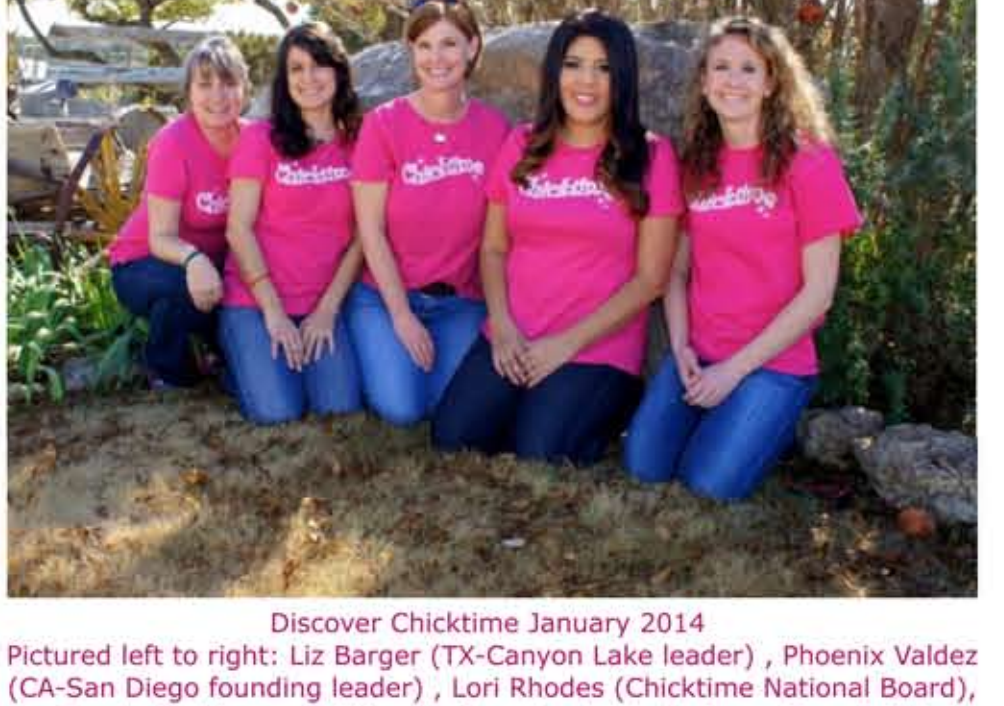
Discover Chicktime January 2014

So far, it has been a remarkable success!