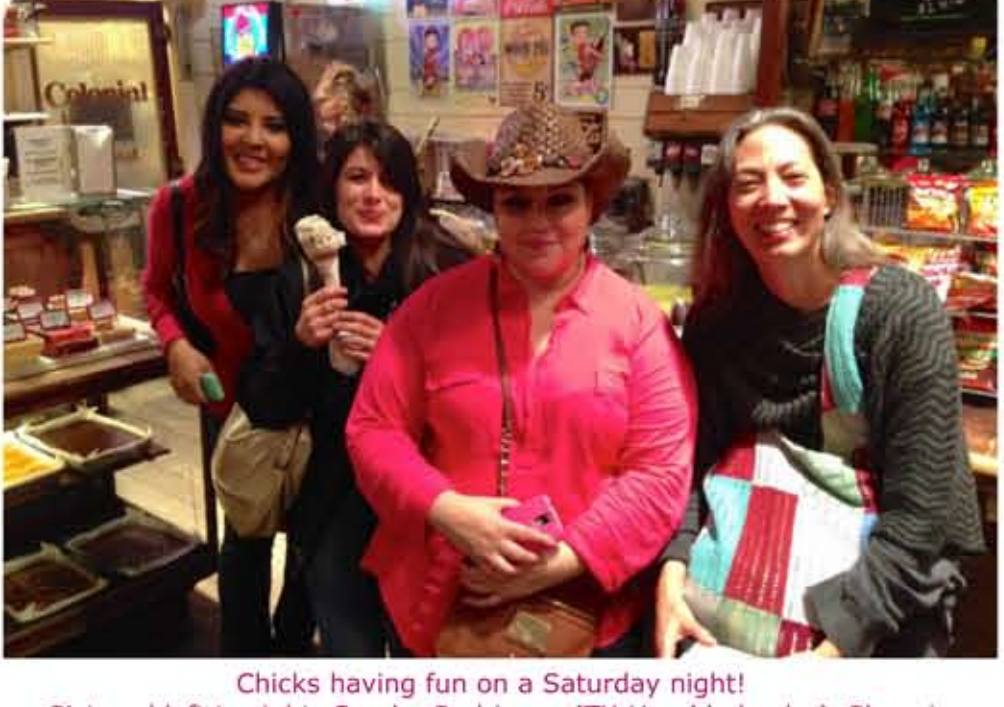
Chicks having fun on a Saturday night!